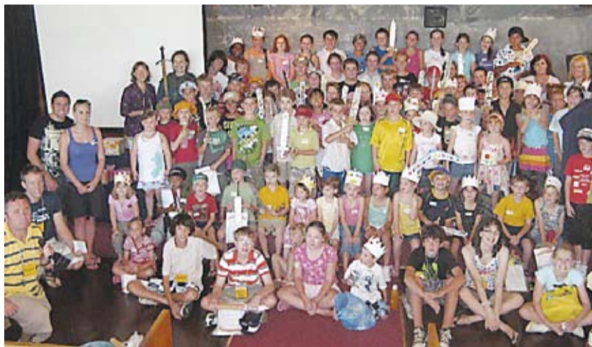
Wynnnum Presbyterian Fun In School Holiday (FISH) Program