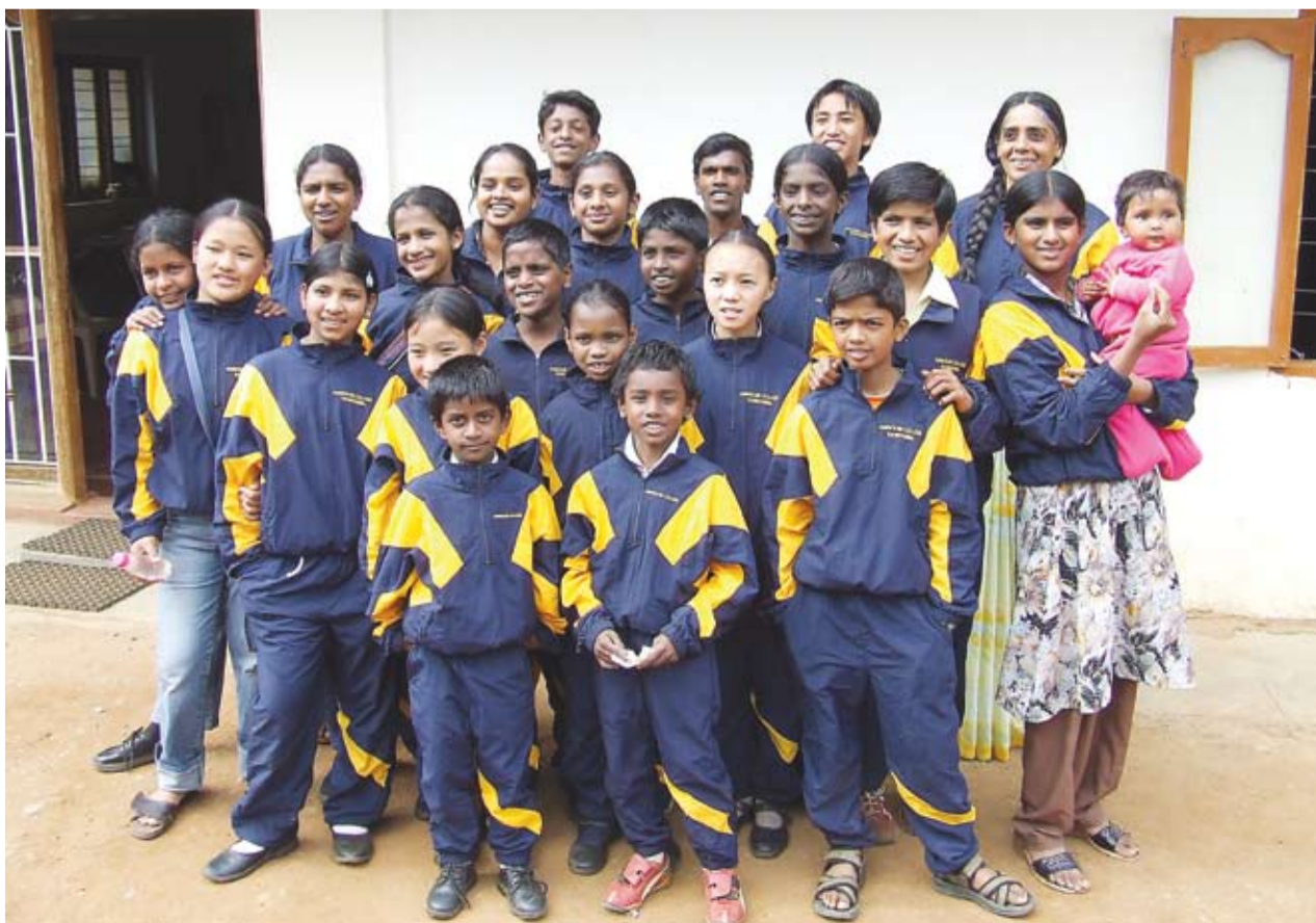
Children of Mizpah Home

"I had 23 little faces smiling at me, each with their own devastating story of pain and loss. Some of these little children had been rescued from the streets or saved from leprosy colonies. Others had lost both parents and had been left to fend for themselves. Some had been found surviving on rubbish heaps or living off banana skins discarded on the street. But smiles were all I could see ... Mizpah Home is where we met those 23 smiling faces.