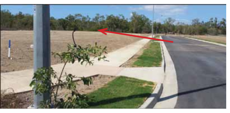
Site for Northside, Townsville's church

Proposed auditorium for Southside, Brisbane