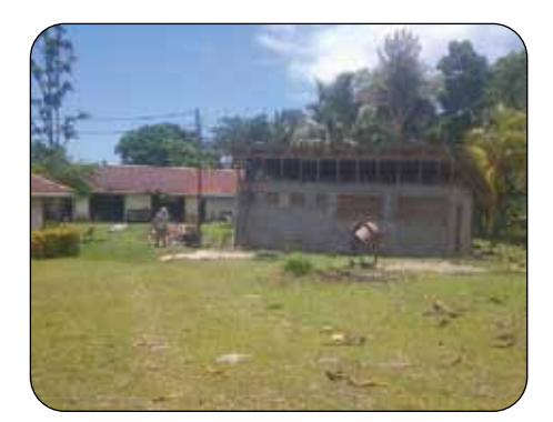
ABLUTION BLOCK, TALUA