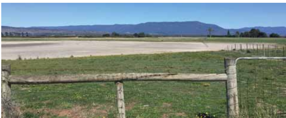
The Midlands area of Tasmania