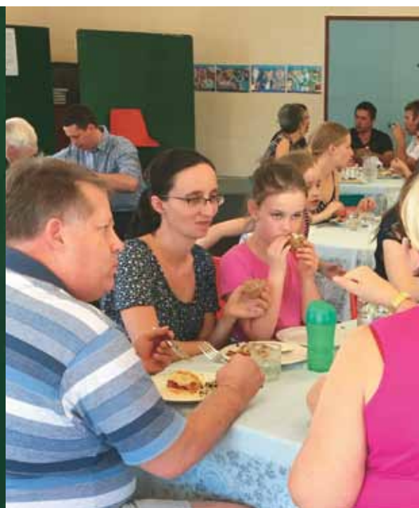
Church Family lunch