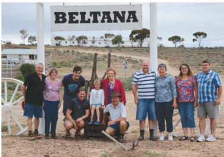
The Easter outreach team at Beltana Station

Like many outback towns, especially those reliant on mining, Leigh Creek has had its ups and downs. In recent months, the closure of the local coal mine has left the residents living with much uncertainty. At one point, the whole town was advertised as being 'For Sale'. People in this area, like people all over the world, desperately need to know that true certainty only comes from knowing Jesus. What a great privilege we have to share Him with them, not just at Easter but right throughout the year.